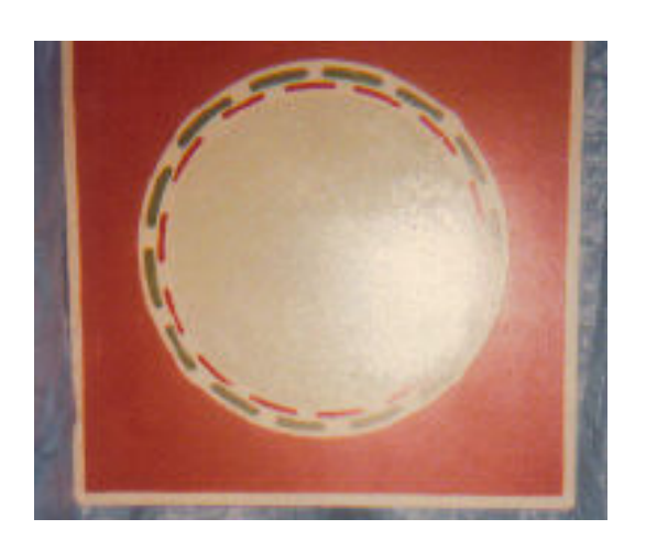
Chart of planet earth used for Ward's global flood theory, Sydney, 1976.

I also include a number of these relevant photos on my website for this work at "Photos."